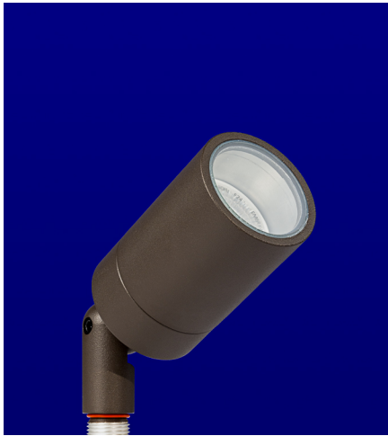
FA-8 Shown in Bronze Texture Powder Coat Finish (BZT) Knuckle: Tapered & Positive Locking