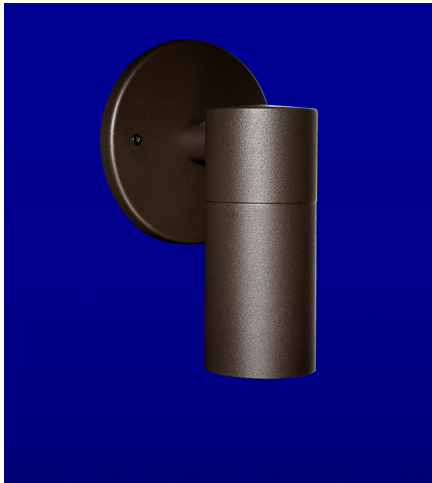
WA-2 Shown in Bronze Texture Powder Coat Finish (BZT)