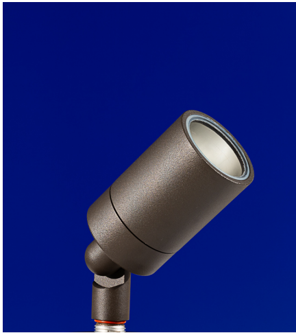
FA-1 Shown in Bronze Texture Powder Coat Finish (BZT) Knuckle: Tapered & Positive Locking