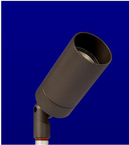
FA-9 Shown in Bronze Texture Powder Coat Finish (BZT) Knuckle: Tapered & Positive Locking