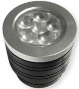
9W LED Module