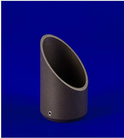
AY-10 Shown in Bronze Texture Powder Coat Finish (BZT)