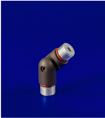
AY-7 Shown in Bronze Texture Powder Coat Finish (BZT)