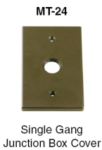
Single Gang Junction Box Cover