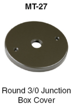
Round 3/0 Junction Box Cover