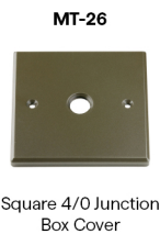
Square 4/0 Junction Box Cover