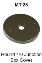
Round 4/0 Junction Box Cover